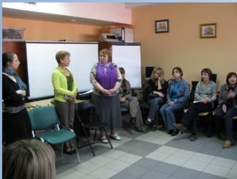
LFOON-SW: Local MAMED Conference

They organized a meeting with mothers of handicapped children. The women are, at the same time, participants of the second edition of "For the Health and Beauty of Life" Project, being implemented by LFOON SW in the framework of EFS. The guests from France presented their solutions in regards to handicapped persons and ways of assisting a family with a handicapped child.