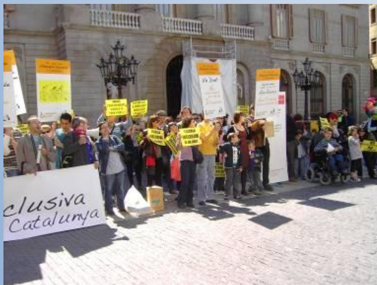
ECOM: demonstration carried out in favour of an inclusive new Law of Education in Catalonia

The Parliament of Catalonia (Spain) is near to approve a new Law of Education. These new legal frame will recognize the international tendency to an Inclusive School although introduce very few dispositions to make the school able to be responsive to the diversity of needs of all students, especially those with permanent handicaps. ECOM, member of MAMED, knows that an inclusive education is basic to improve the opportunities of an afterward incorporation to labor market, therefore ECOM supported on past April a massive demonstration in front of the Catalan Government site in Barcelona.