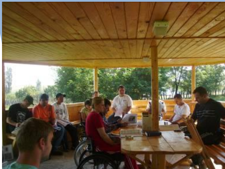
Motivation Romania: the network training