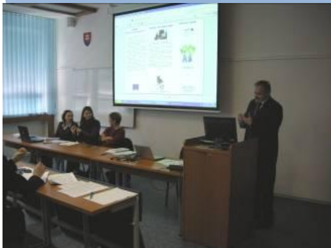
Handicap et Libertés visiting the Technical University of Kosice (Slovakia)